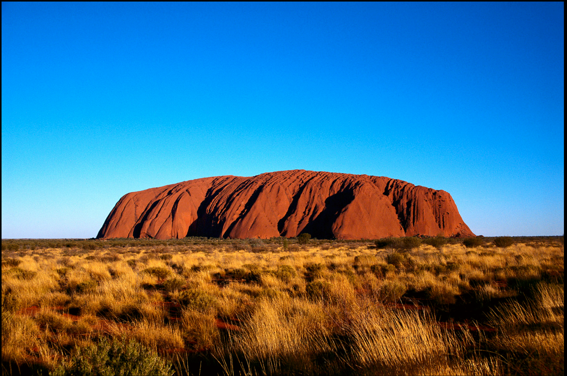
Ayers Rock, Australia