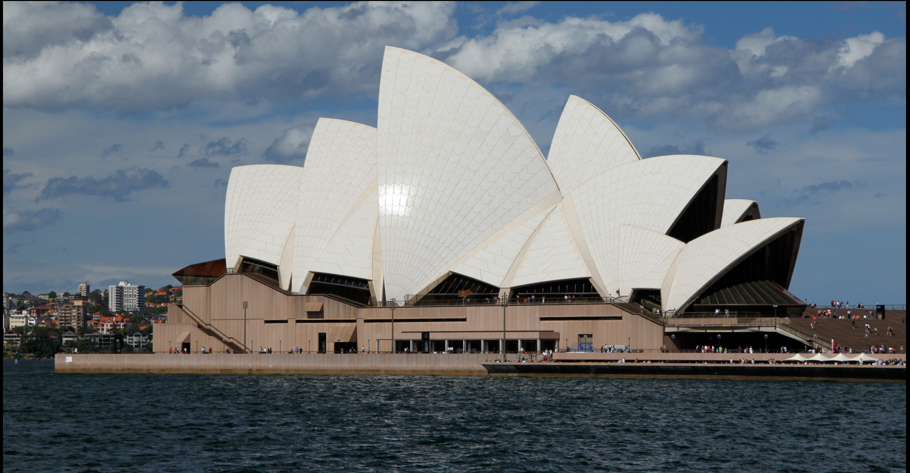
Sydney Opera House, Sydney, Australia