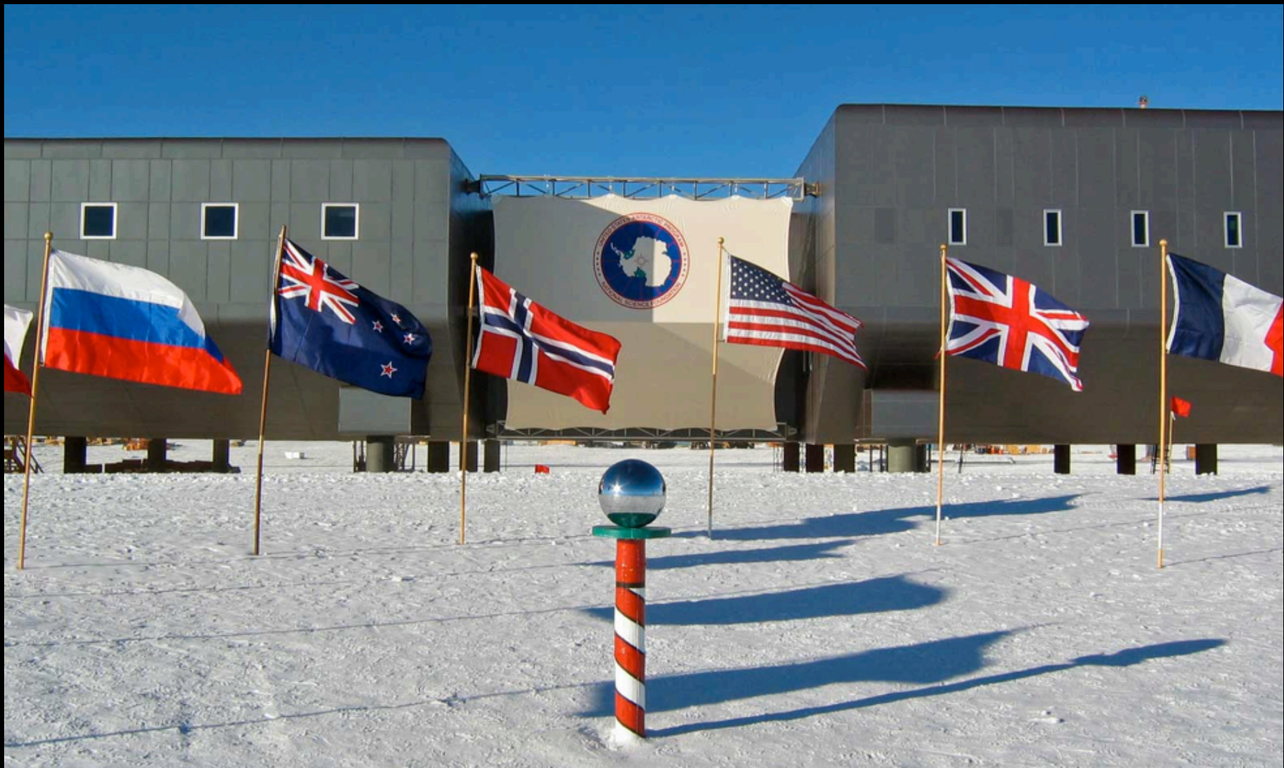
Amundson/Scott South Pole Station, Antarctica