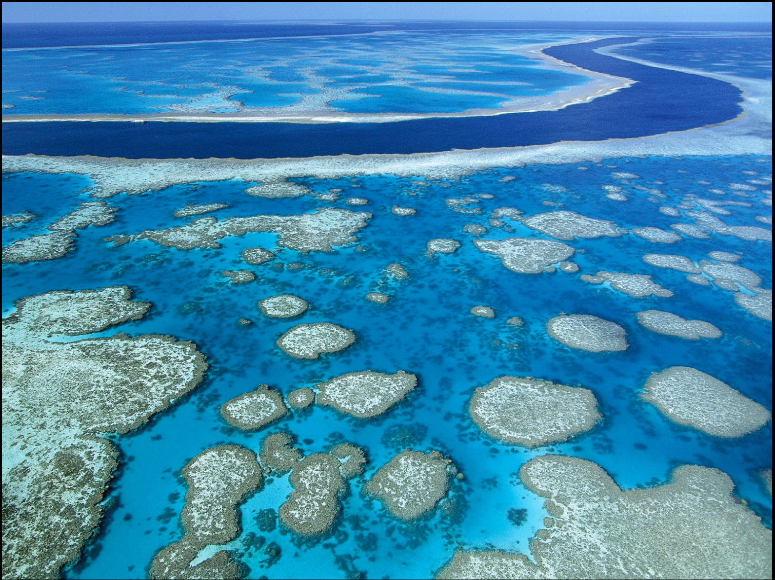
Great Barrier Reef, Australia